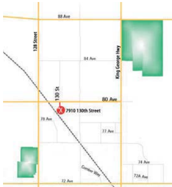
North Surrey: 7910 130th Street