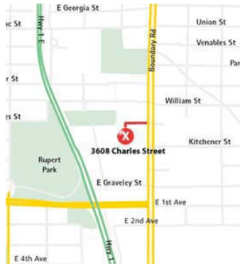
East Vancouver: 3608 Charles Street