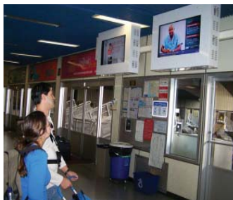
Seabus South East Terminal