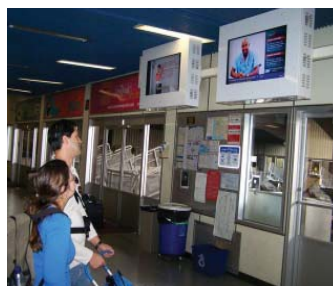
Seabus South East Terminal