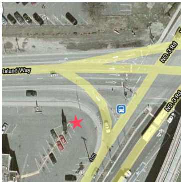
★ Comfort Inn Richmond (Southwest Corner of No.3 Rd. & Sea Island Way)